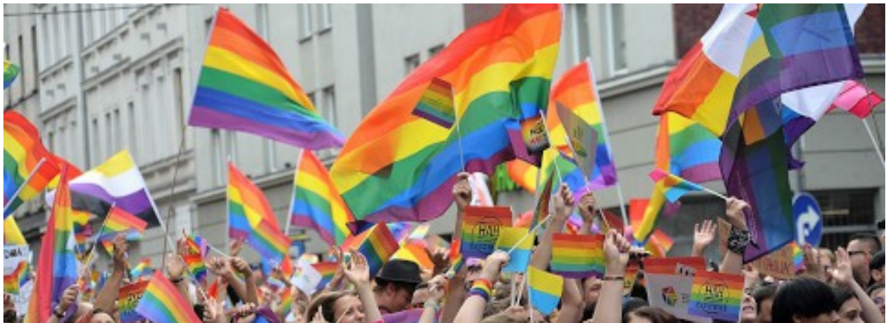
Katowice Pride

It's that time of year in Ottawa! UUFO wishes all our queer and trans members and friends a happy Pride! Celebrate each other, even at a distance, and keep on fighting for tomorrow.