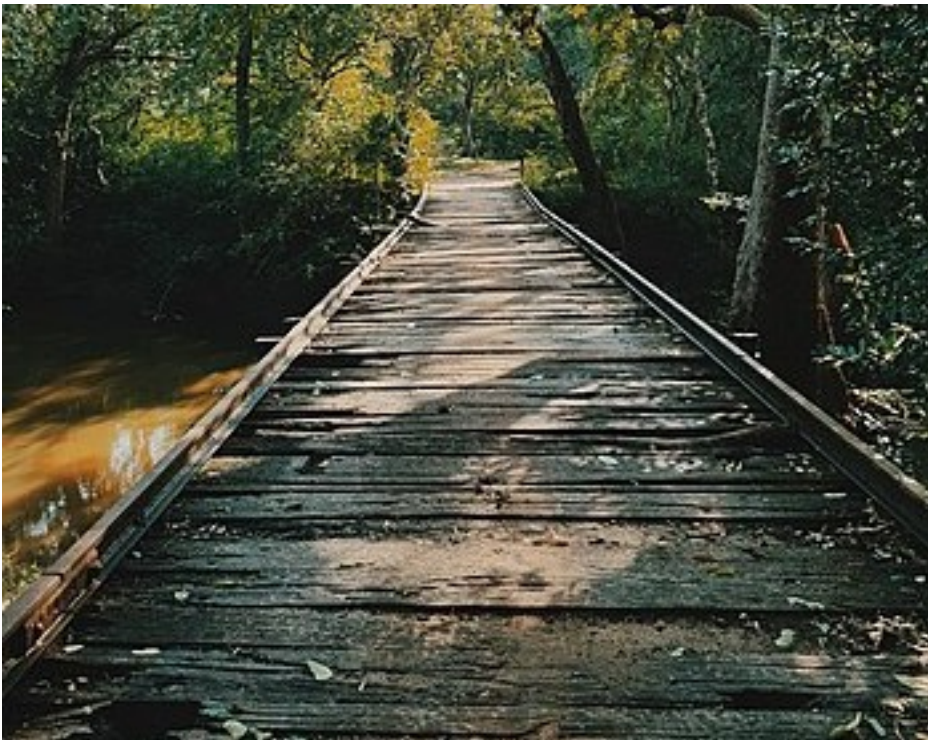
The Old Wooden Bridge