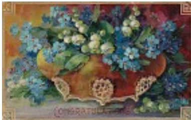
Image of vintage "congratulations" card

Please enjoy these short updates as UUFO Members and Friends fill us in on what they've been celebrating.