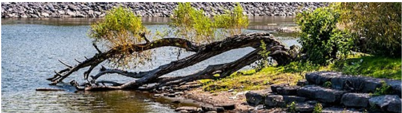
Ottawa River

All the films we watch are available on Netflix or for free on YouTube, Kanopy or Hoopla. Kanopy and Hoopla are free with a Ottawa Public Library membership. We, in the movie group, are always happy to welcome new participants. We are happy to get suggestions for films to watch as well. Hope to see you at the movies virtually.