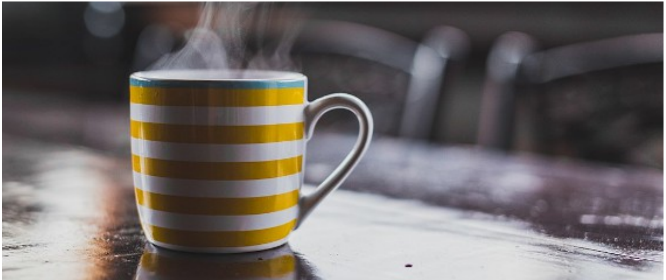
Bucharest Mug