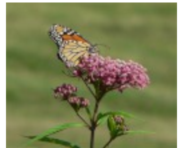
Swamp Milkweed Monarch